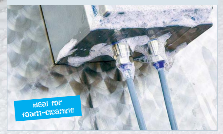
Excellent solution for applications, which are cared with foam-cleaning: HSK-INOX-HD