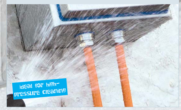
Recommended in all areas, which are cleaned by high-pressure cleaning: HSK-INOX-HD-Pro